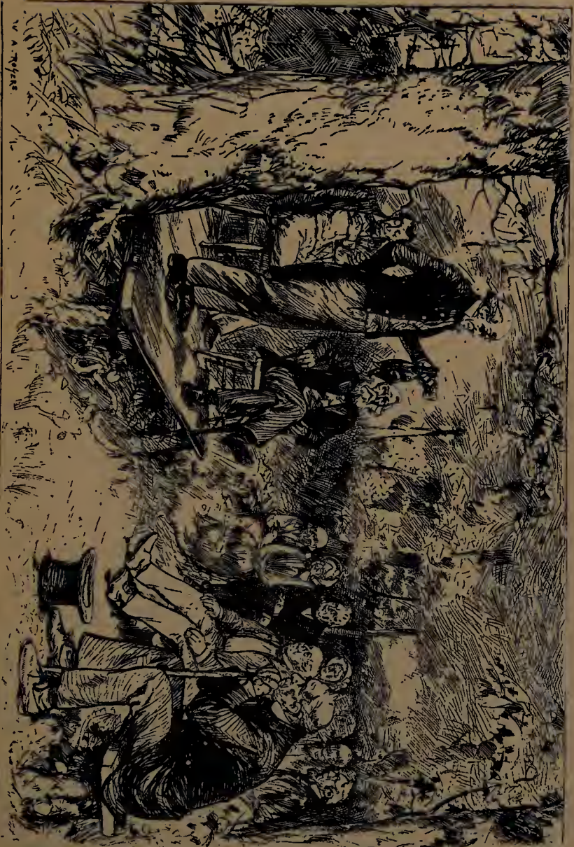
“THE OLD GUARD OF THE WOODS.”